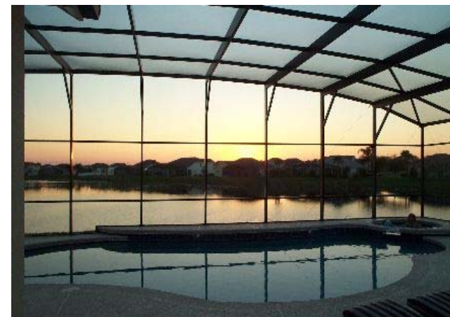
Watch the sunset from the south-west facing pool & deck & lanai)

What better way to relax at the end of a long day at the attractions than to watch the sun set from the south-west facing 40 x 18 ft heated pool (set to 86 degrees F) or the spa (set to 102 degrees F) overlooking Star Lake! The secluded and private lanai and 60 ft caged deck are amply equipped with patio furniture and are perfect for sunbathing.