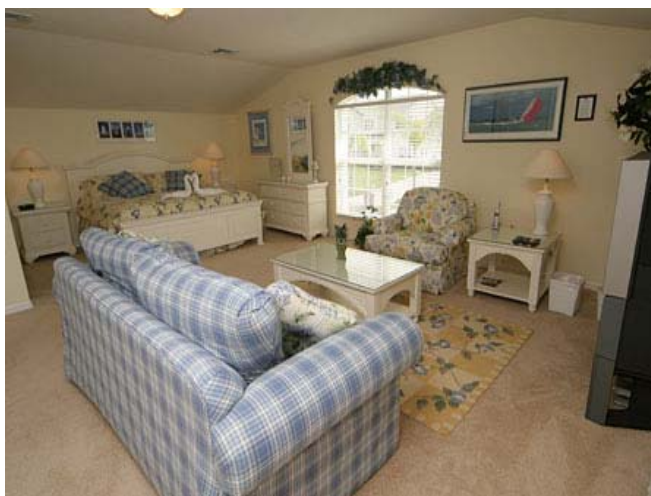
Second Master Bedroom

The interior furnishings of Villa "Sea Pearl" are superior to the standard furniture packages, as not only is this our own holiday home, we wanted it to be home from home for the more discerning guests. 24-hour secure wireless broadband connection. (Please bring your own laptop.) Free long distance telephone calls in North America and to various European countries.